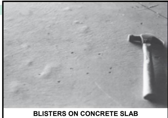
BLISTERS ON CONCRETE SLAB

eliminate and rebond the blister areas. A wood tool could be used to open up the surface. In some cases, climatic conditions and the concrete mixture may be the factors that are causing blisters. The crew size should be adequate to handle finishing larger areas or for tight schedules to complete work, so that timing of finishing operations is not too early on some portions of the slab. Additional information and recommendations are given in ACI 302.1R.